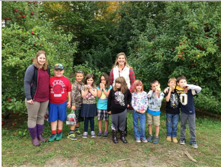
MS. HASKINS & MS. GONDELA'S STUDENTS

The Pioneer Valley Regional School District does not discriminate on the basis of race, color, religion, national origin, age, sex, gender identity, sexual orientation, housing status, or disability in admission to, access to, employment in, or treatment in its programs and activities.